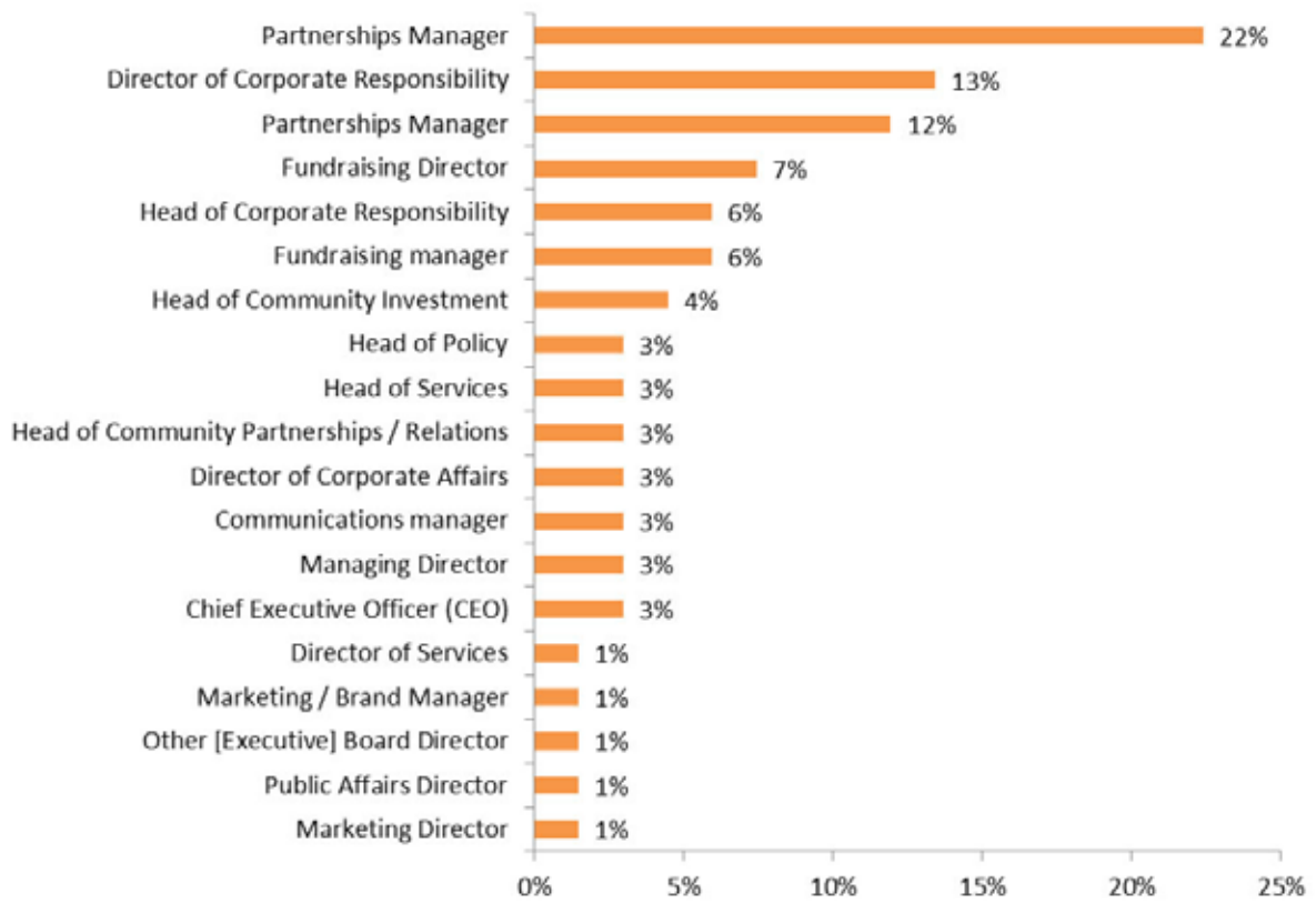
Figure 28: Respondents' roles